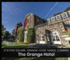
STATION SQUARE, GRANDE-OVER-SANDS, CUMBRIA The Grange Hotel