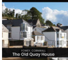
POWELL CORNWALL The Old Quay House