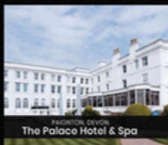
FAIRFORD, DEVON The Palace Hotel & Spa