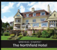
MINNEHEAD, SOMERSET The Northfield Hotel