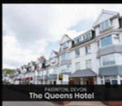
FAIRFORD, DEVON The Queens Hotel