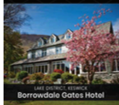
LAKE DISTRICT, REDBRIK Borrowdale Gates Hotel