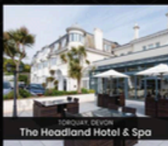
TORQUAY, DEVON The Headland Hotel & Spa