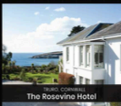
STURD, CORNWALL The Rosovine Hotel

CHARMING HOTELS ACROSS THE LANDSCAPE OF THE UK