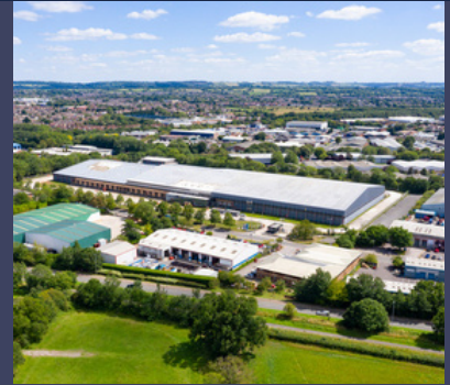
WAREHOUSE & INDUSTRIAL