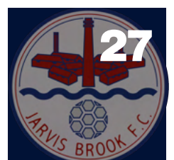
Next Away Trip