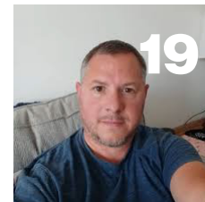
Trevor Knell Column