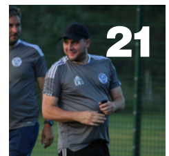
Our Other Sides