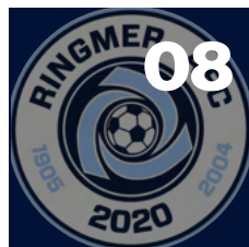
Ringmer AFC History