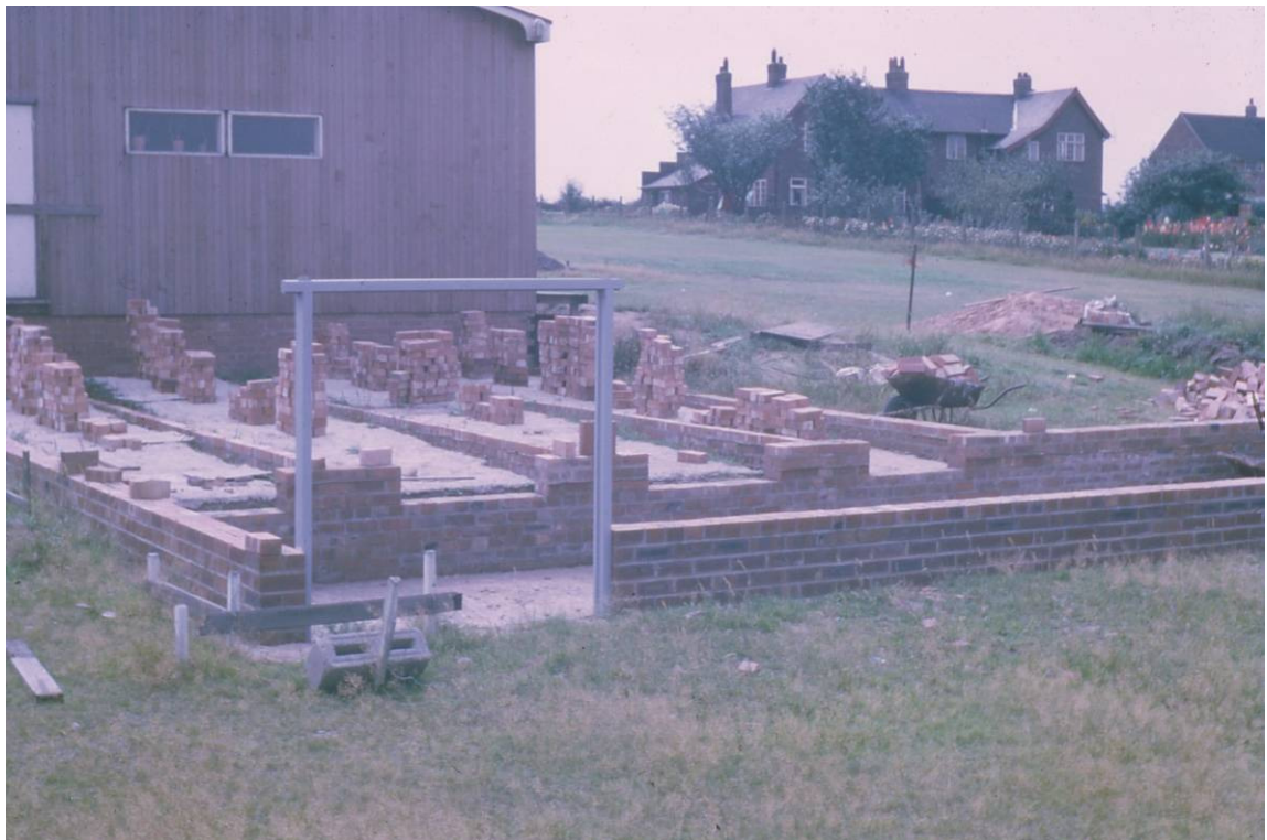
Clubhouse 1 Phase 2 extension starts in 1970; this view is of the new canoe stores