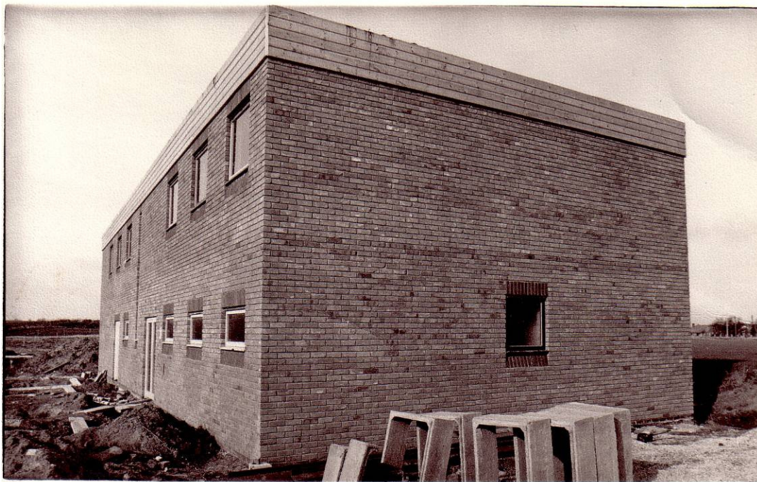
The second Clubhouse – 1980