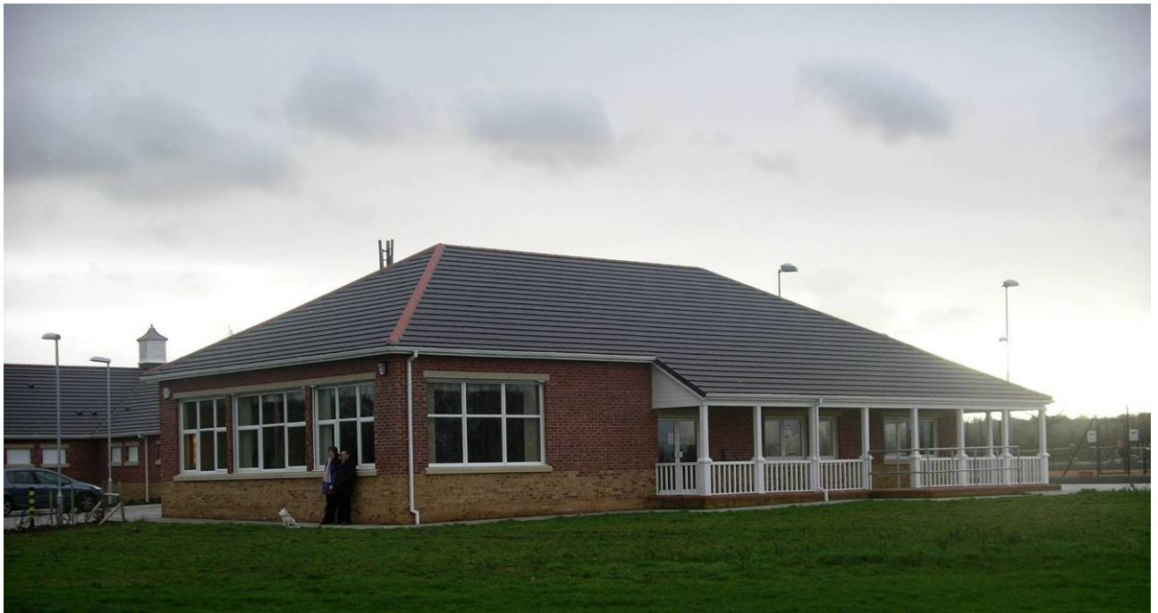
The Third Sports Club ~ January 2007