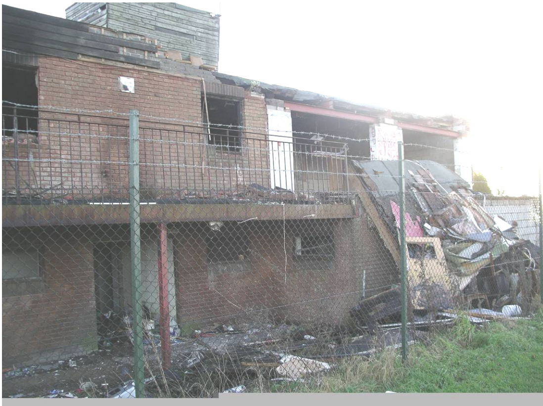
A sad end to the second Sports Club ~ January 2006