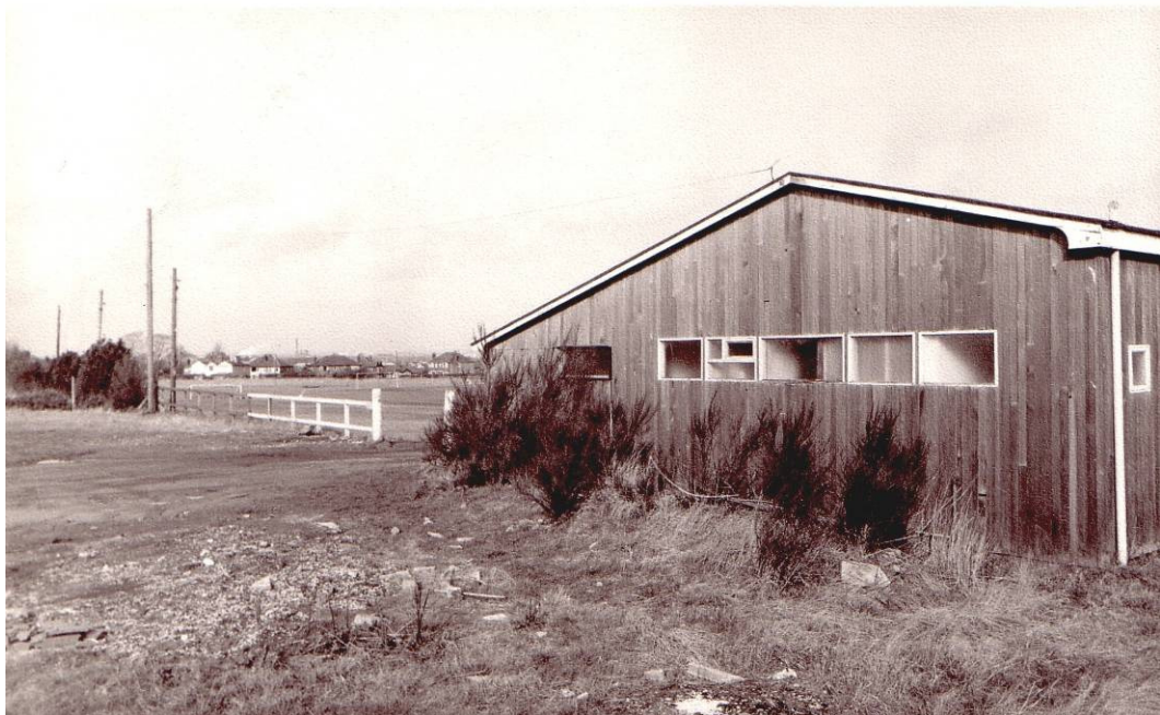
Clubhouse 1 Phase 2 extension completed