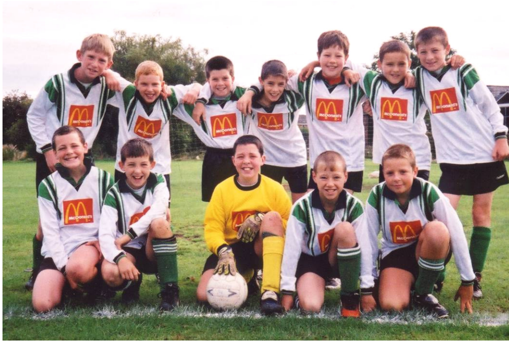
U13s 2000~2001 season