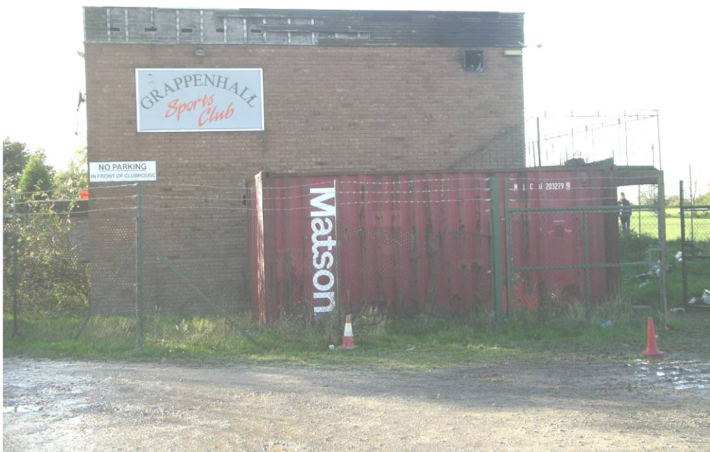
The second Clubhouse 2005

Effectively the Junior Football Section was now the only active section of the club and its only source of income.