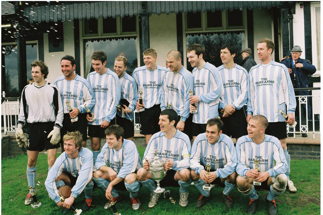
Guardian Cup Winners 2005~2006