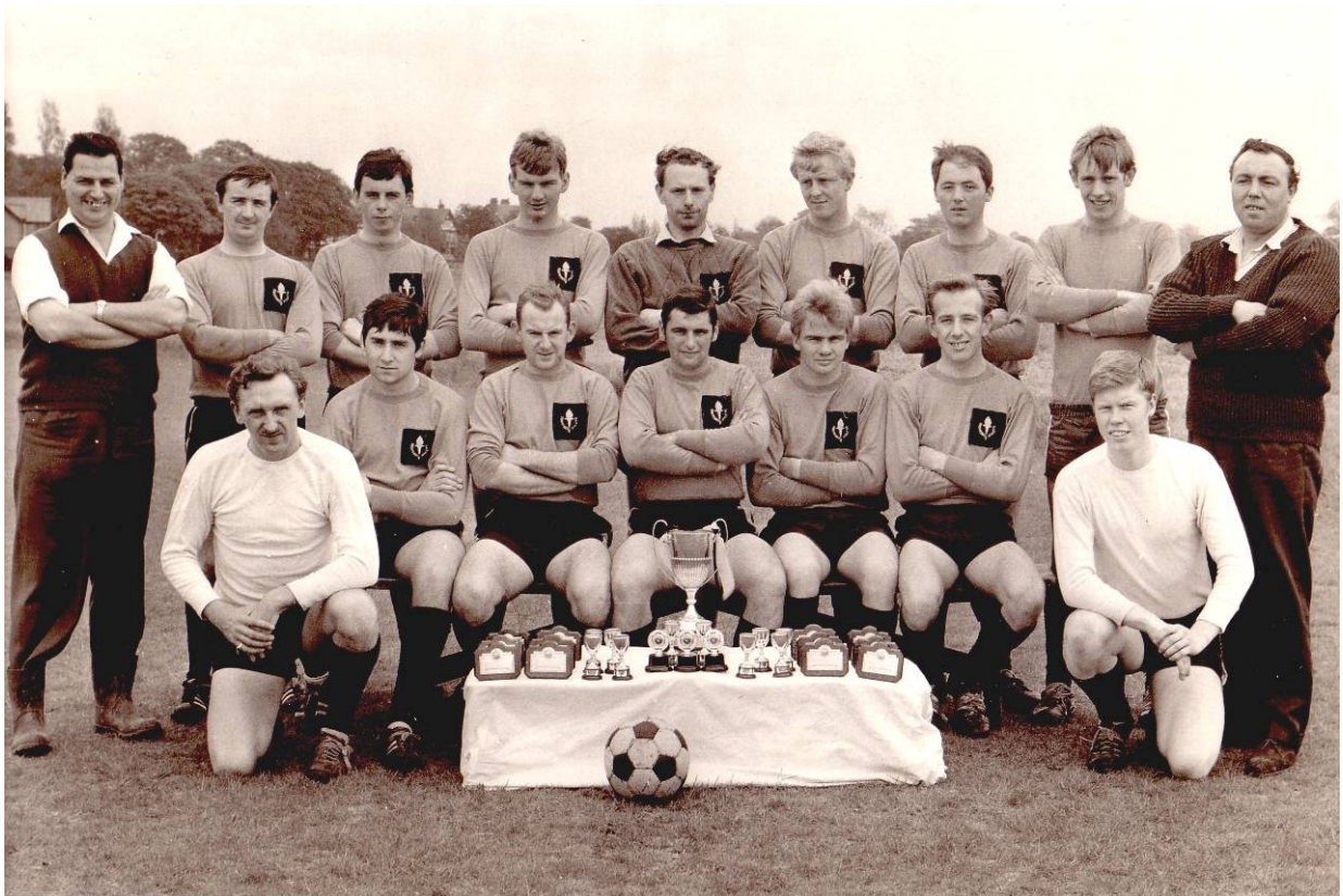
Grappenhall Athletic Club Football Team 1966~67

It was not long after the Athletics Club moved to Stockton Lane in 1961, that the Grappenhall Sports Club Football Team started, and continues to this day.