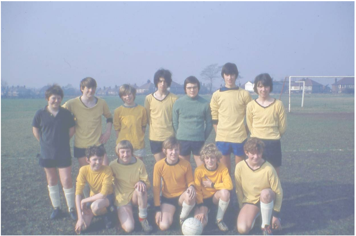
Grappenhall Sports c1968