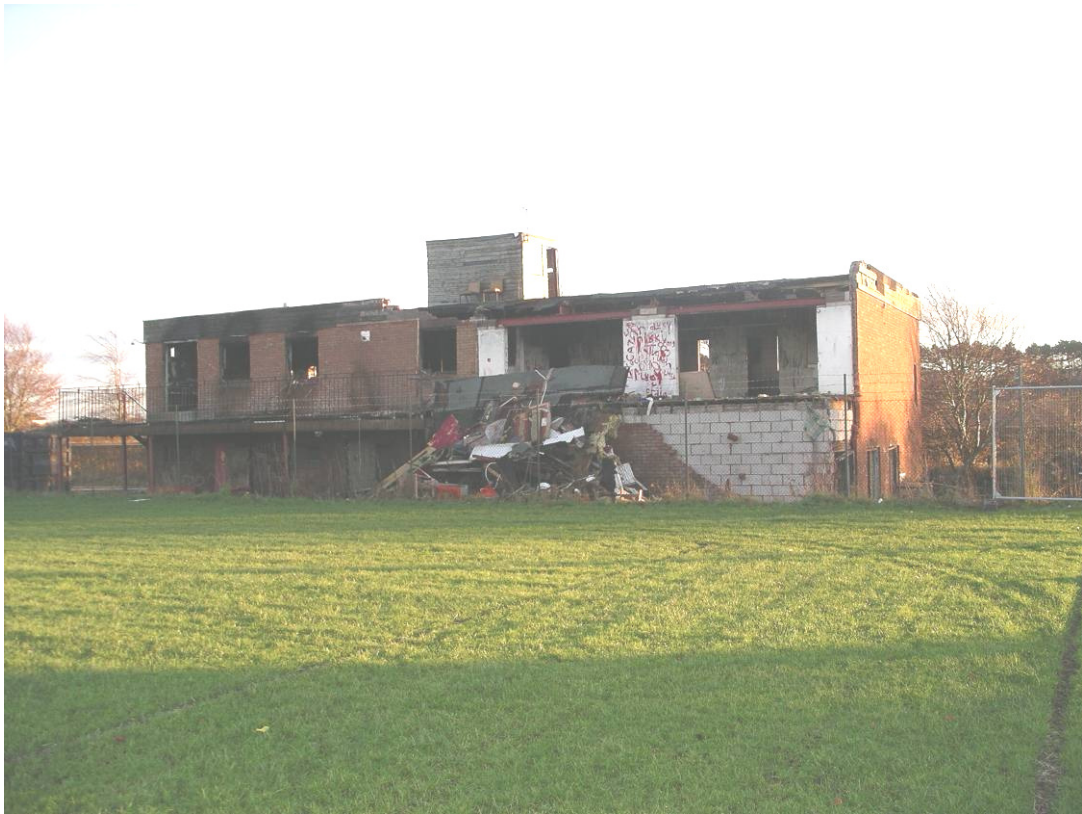
The second Clubhouse 1 st January 2006