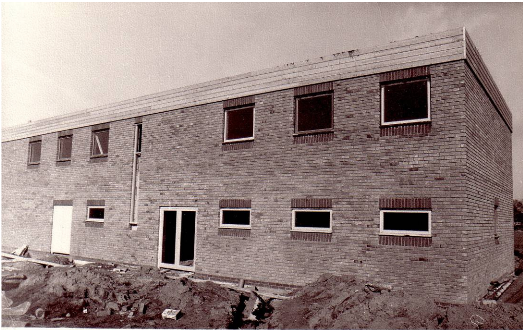
Construction of the second Clubhouse – 1980

By the late 1970's work had started on the construction of the second home, but £24,500 would only provide the shell of the building and a flat roof, the members had to kit out and furnish the interior themselves, this included wiring, plumbing, internal decoration, and the installation of an Aluminium main feeder cable from the east end of the site. Various volunteers busied themselves to complete the works for the grand opening due in the summer of 1981.