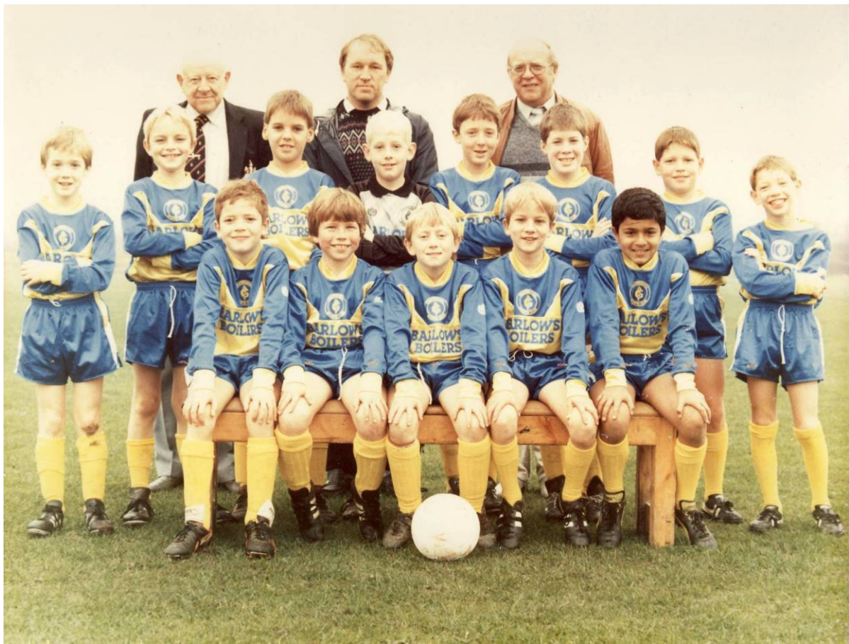
GSFC Under 11s 1988 ~1989