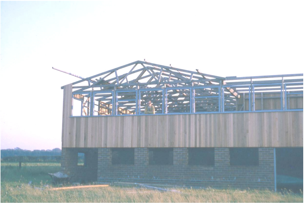
Clubhouse 1 Phase 2 extension with Phil Maskall looking on