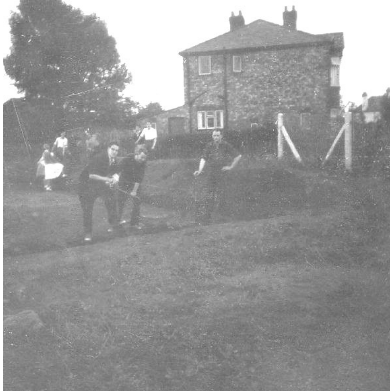
Constructing the 100 yard six lane track, at the entrance to Euclid playing field ~ 1955

The following photographs taken in 1955 are all from the newly formed athletic club at Euclid Avenue: