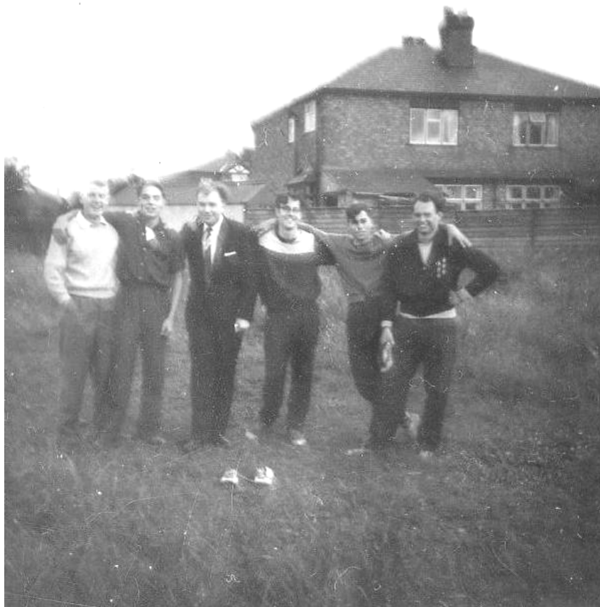
The playing field group....