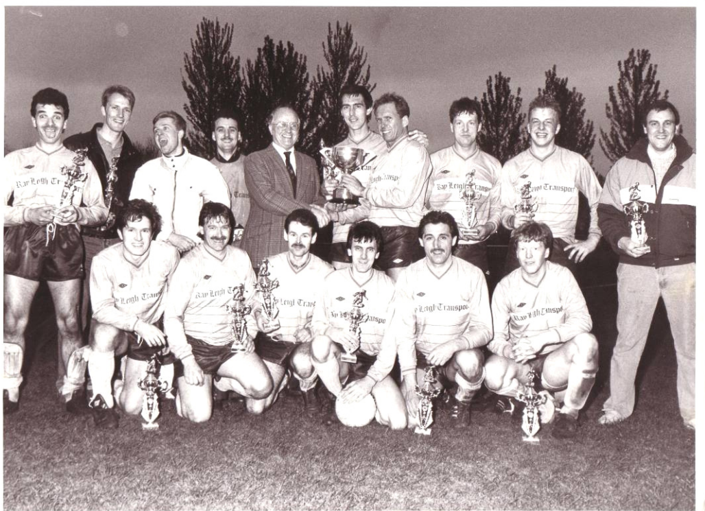
Grappenhall Sports Club FC Warrington & District Football League Div 2 Champions & Rylands Cup Double Winners 1982 ~ 1983