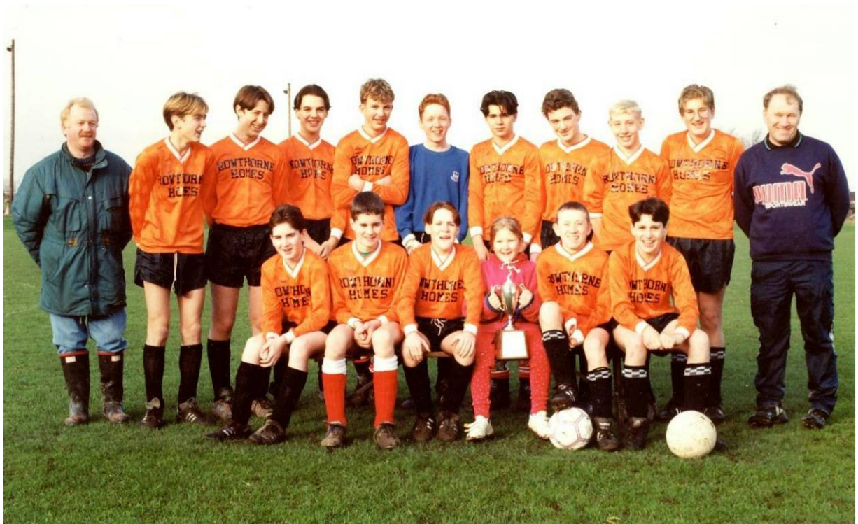
GSFC Under 15s 1993 ~1994