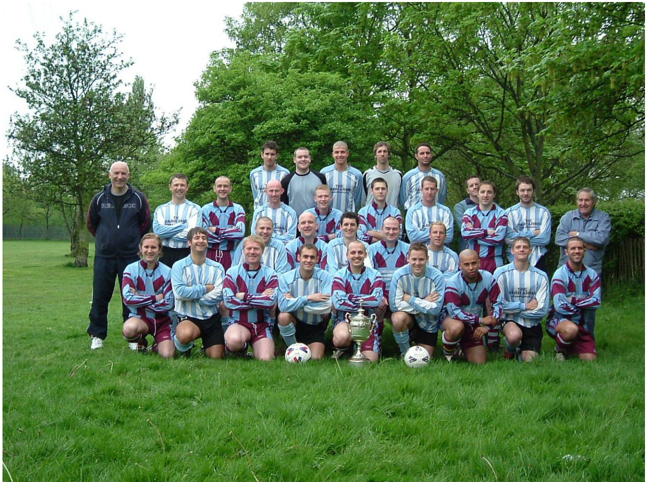
Guardian Cup Winning Squad 2005~2006