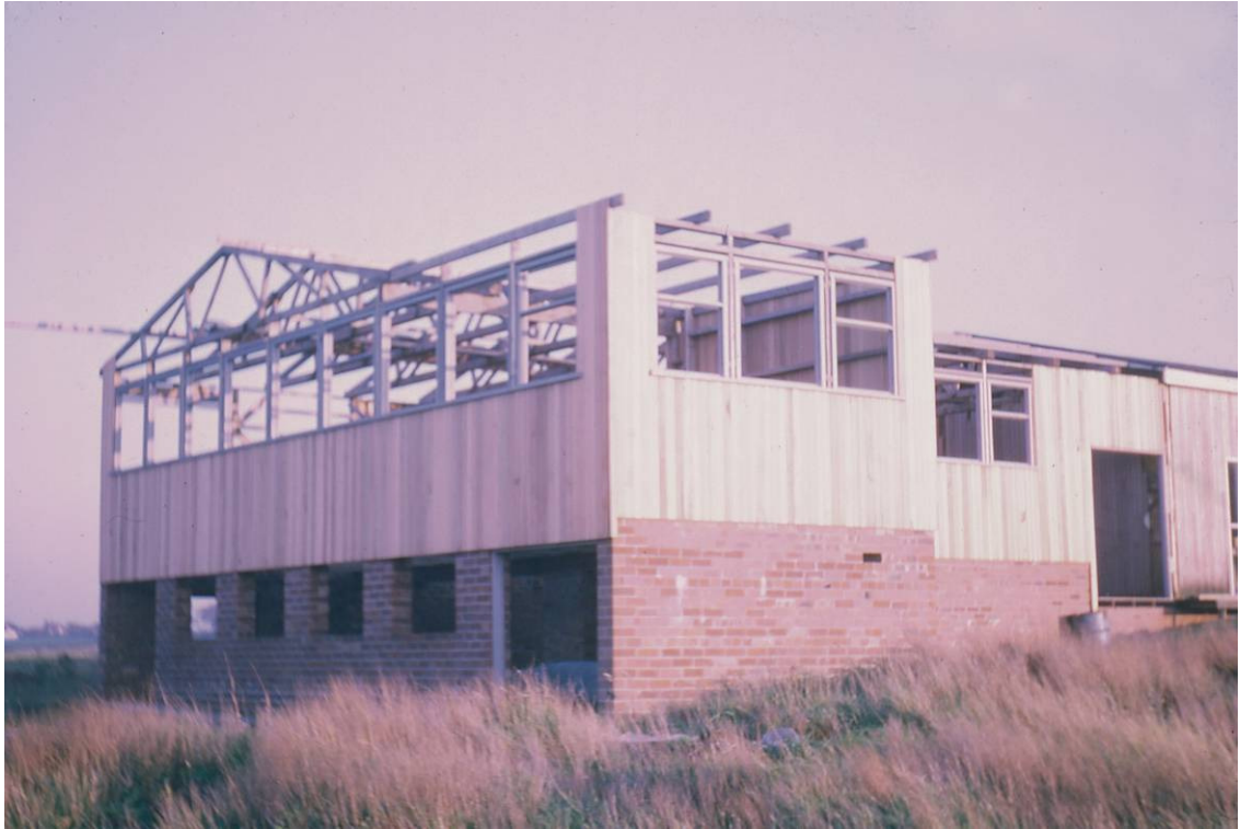
Clubhouse 1 Phase 2 extension almost complete