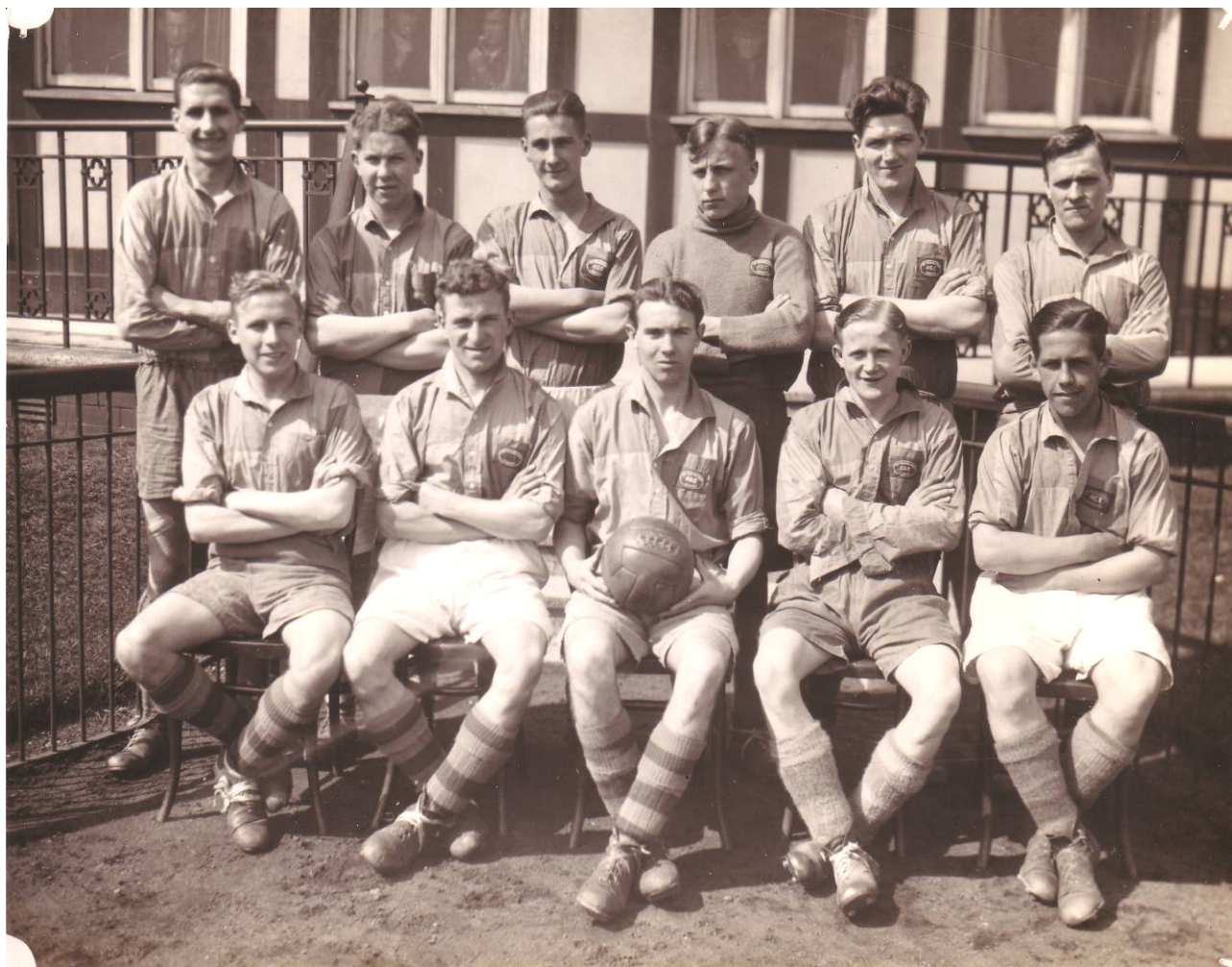
The first team to play at Stockton Lane Stockton Heath ATC Football Team 1940/1941