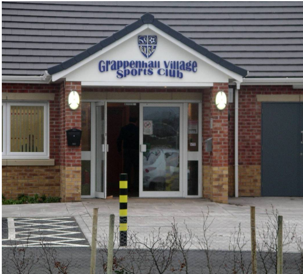
The Third Sports Club ~ January 2007