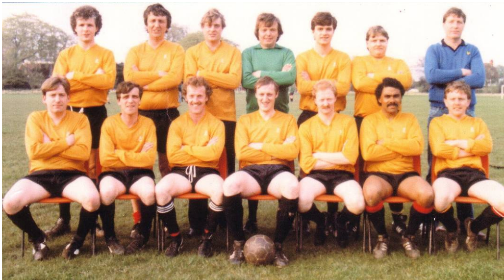
Grappenhall Sports Club First Team circa 1978 (The name changed from athletic club to sports club in 1972)