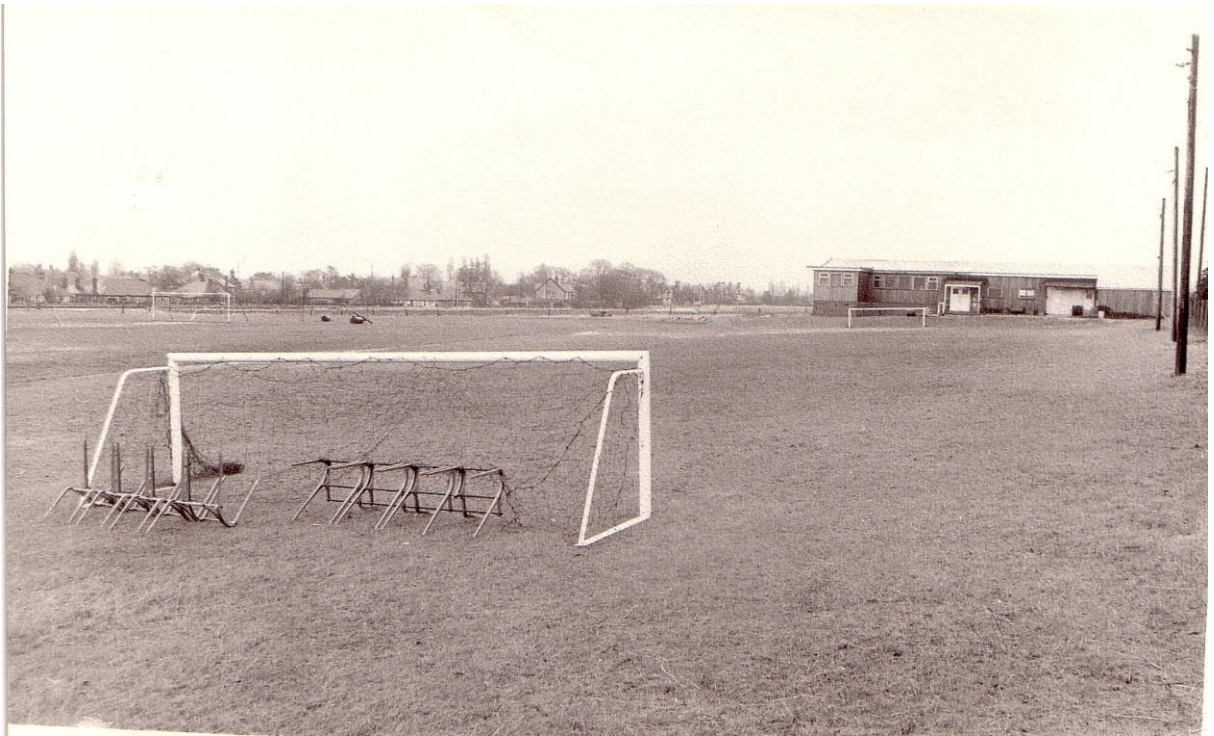
Clubhouse 1 Phase 2 extension completed