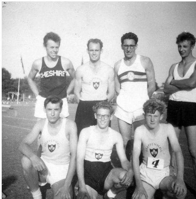
Manchester Highland Games - 1959