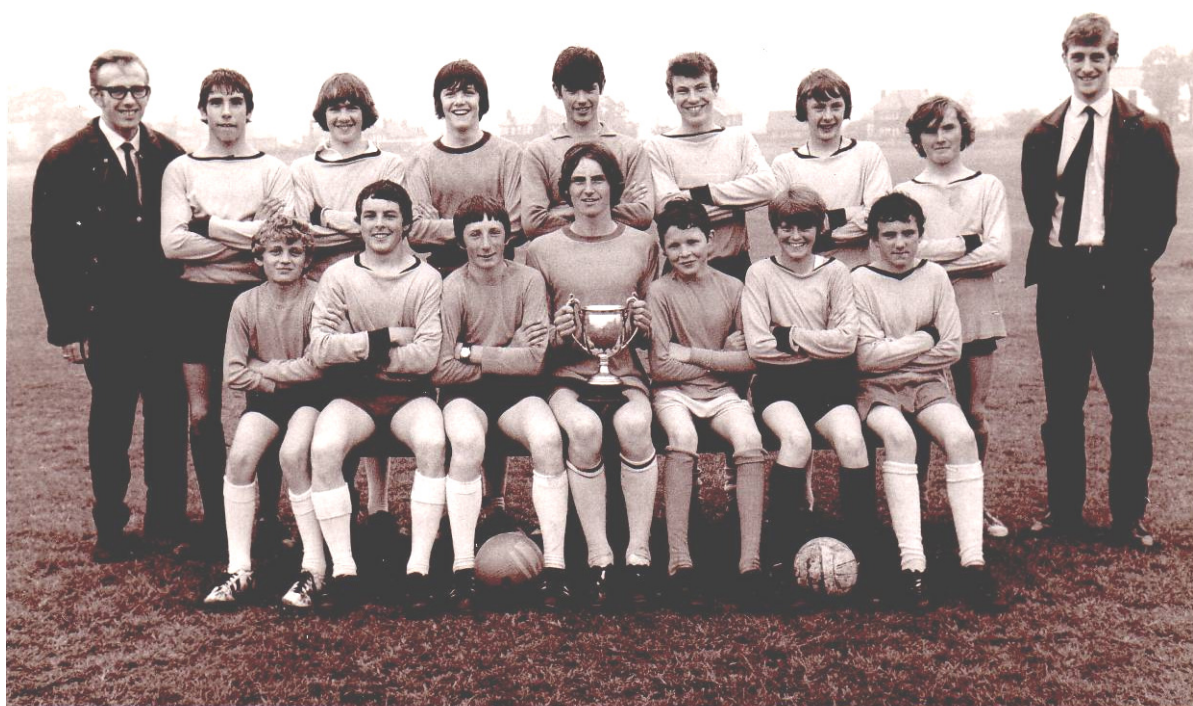
Grappenhall Athletic Club Football Team under 15s c1970

Following the housing development of the fields adjacent to the GYCA, circa 1980, Grappenhall Rovers played all their games at Euclid Avenue. Around 1992 the Rovers moved up to Grappenhall Athletic Club and joined the juniors there playing as 'Grappenhall Sports', so forming Grappenhall Juniors. Grappenhall Juniors then moved away from playing in the Hilden League and joined the Mid Cheshire Youth Football League, using pitches at Stockton Lane, Euclid Avenue and the Little Manor in Thelwall.