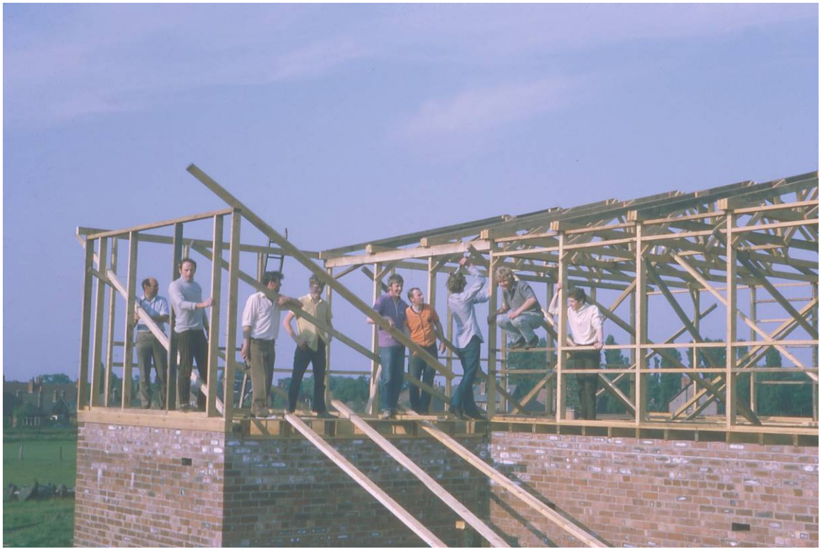
Clubhouse 1 Phase 2 extension