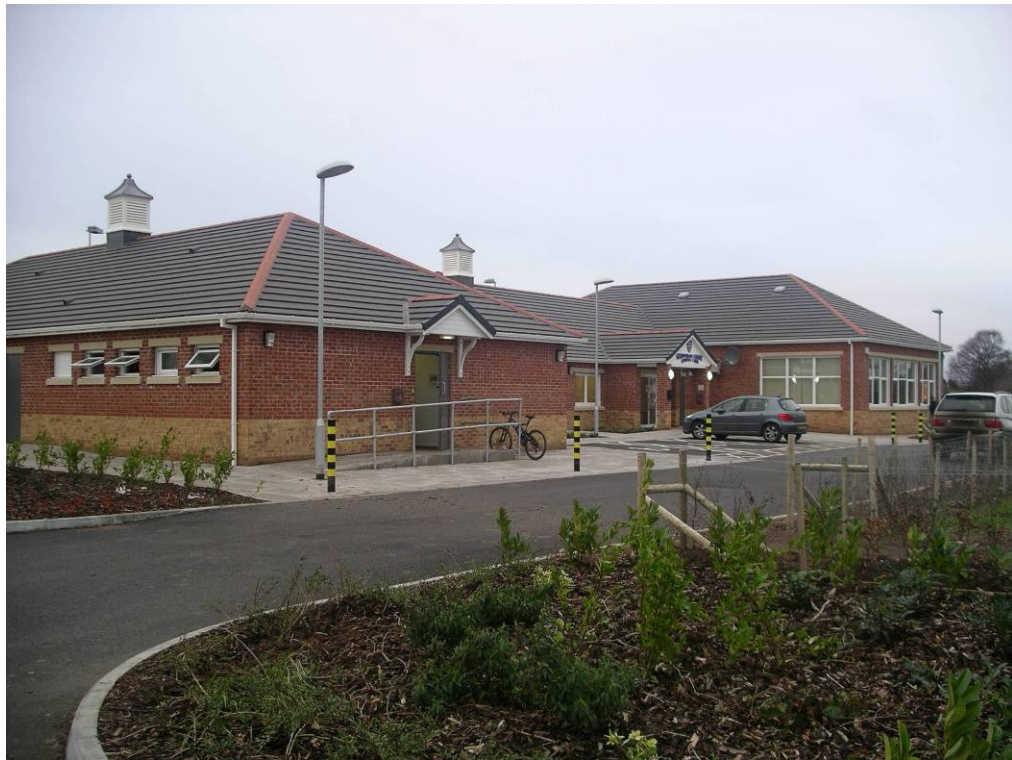
The Third Sports Club ~ January 2007