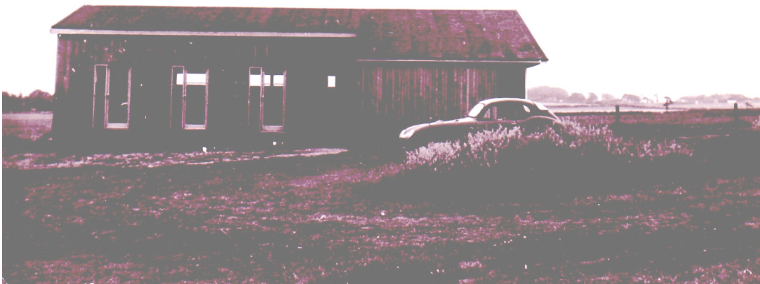
A view of the original clubhouse completed in 1964

In 1961 with the voluntary efforts of its members, the club raised money mainly from organising fortnightly dances for the local youth, in the village hall (the large room) and started marking out a six-lane 440-yard running track and levelling the ground, in 1962 the construction of the first clubhouse commenced. A mountaineering & rock-climbing section was formed in 1963, with many expeditions to the Lake District, Snowdonia, Scotland and the Continent. The clubhouse was completed a year later in 1964, just in time to witness a club member break the UK pole vault record of 14ft 4in whilst in training, unfortunately this could not be ratified by the AAA. Also the football section formed in 1964 joining the Warrington District League, with the new pitch constructed within the oval running track and ready for the 1965/1966 season. The canoe section formed in 1966 and within two years had representatives at the 1968 Mexico Olympics. A year later canoe section members win honours at the Junior British Championship, Senior Irish Championship, Junior & Senior Spanish Championship and the British White-water Championships. Preparations were now underway for the 1972 Munich Olympics.