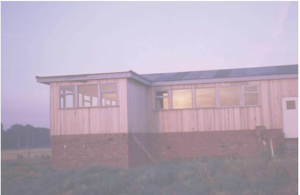
Clubhouse 1 Phase 2 extension completed in 1971