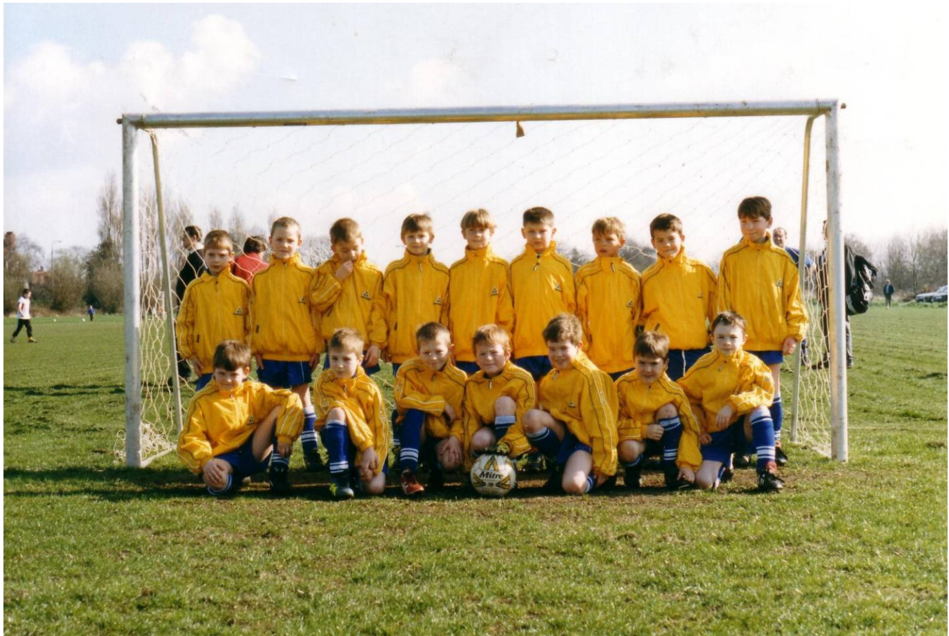
The first small sided soccer team ~ u8s 1998/1999