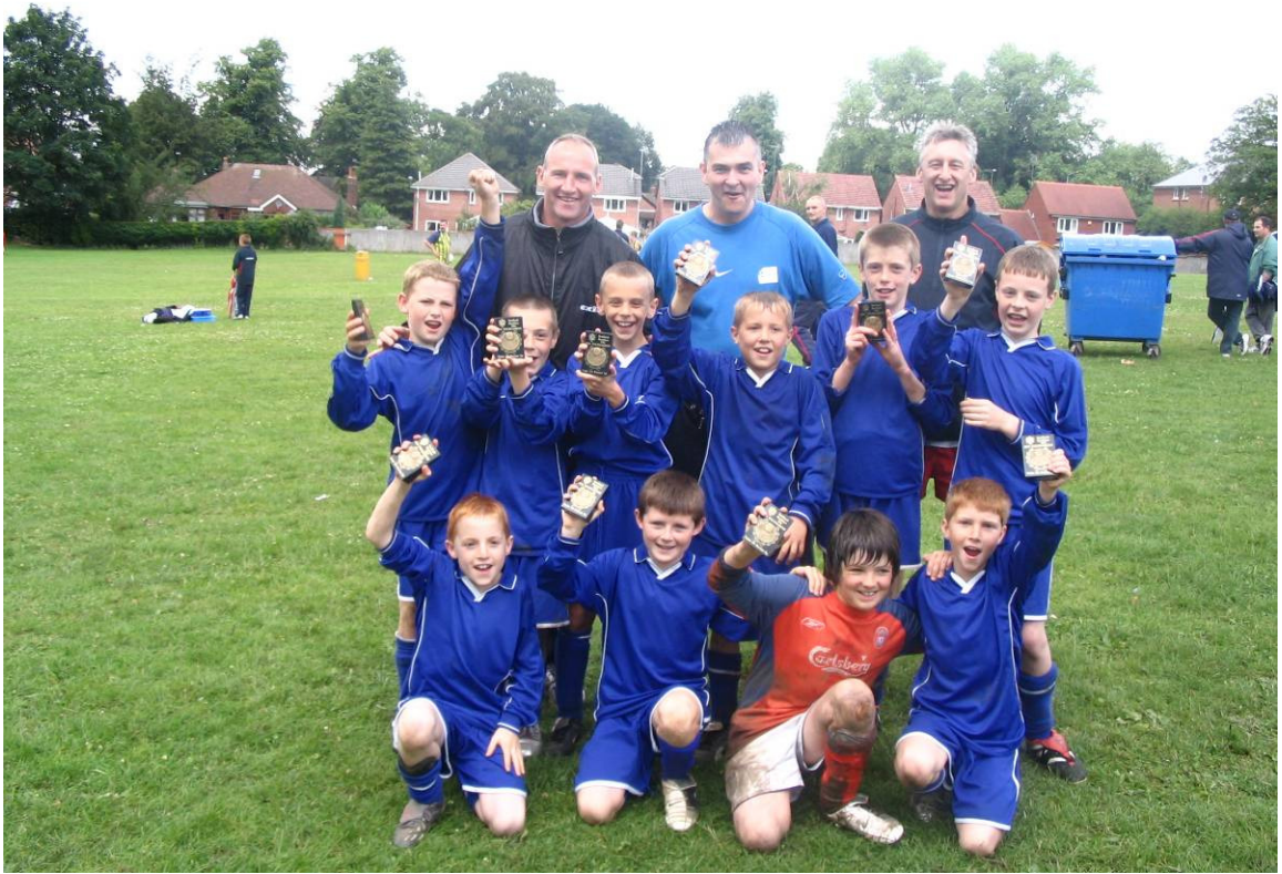
The U10s 2003~2004 season