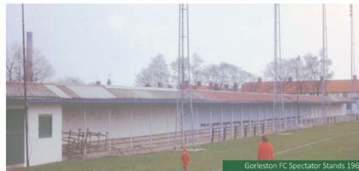
Gorleston FC Spectator Stands 1963