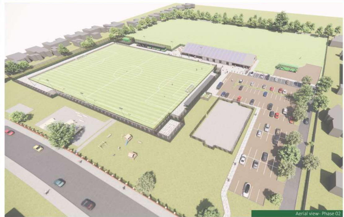
Aerial view - Phase 02