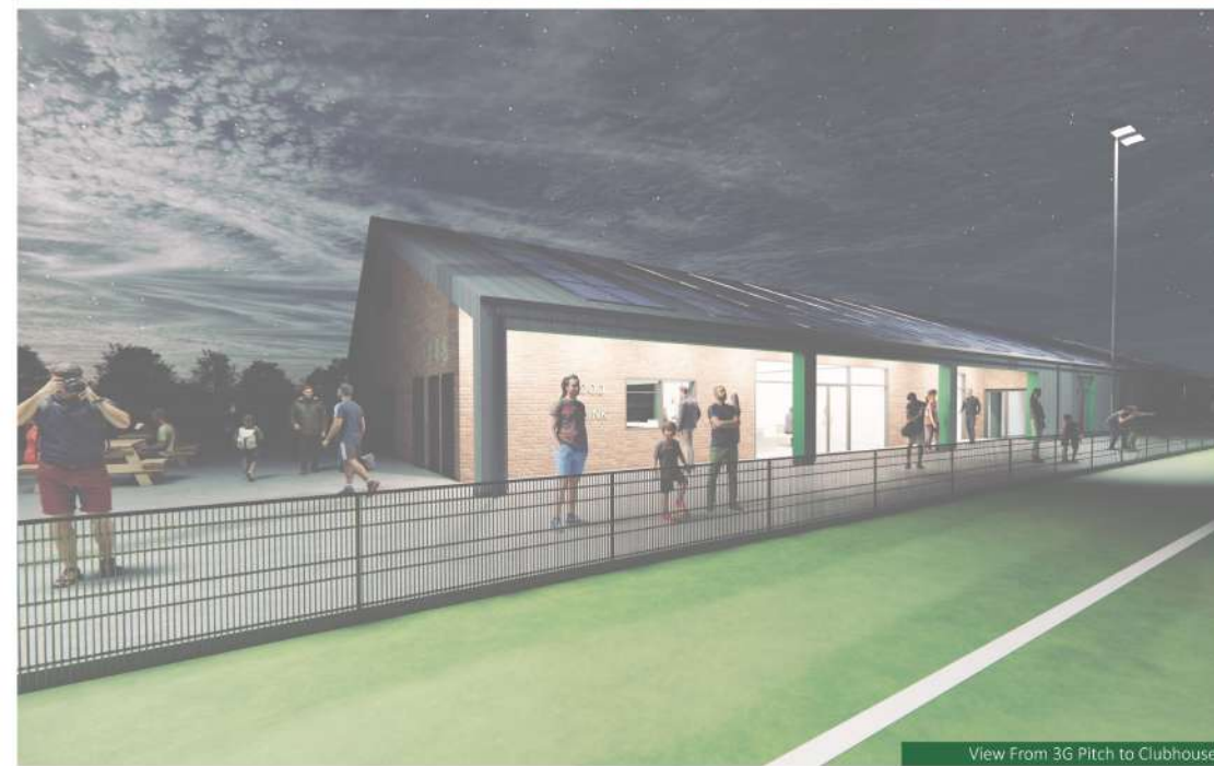
View From 3G Pitch to Clubhouse