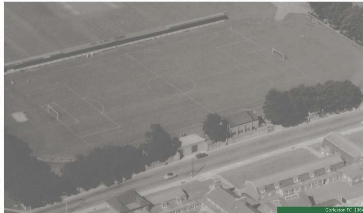
Gorleston FC 1964