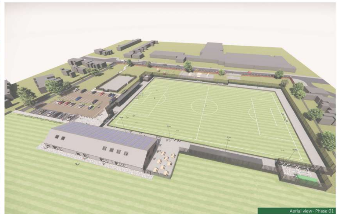
Aerial view - Phase 01