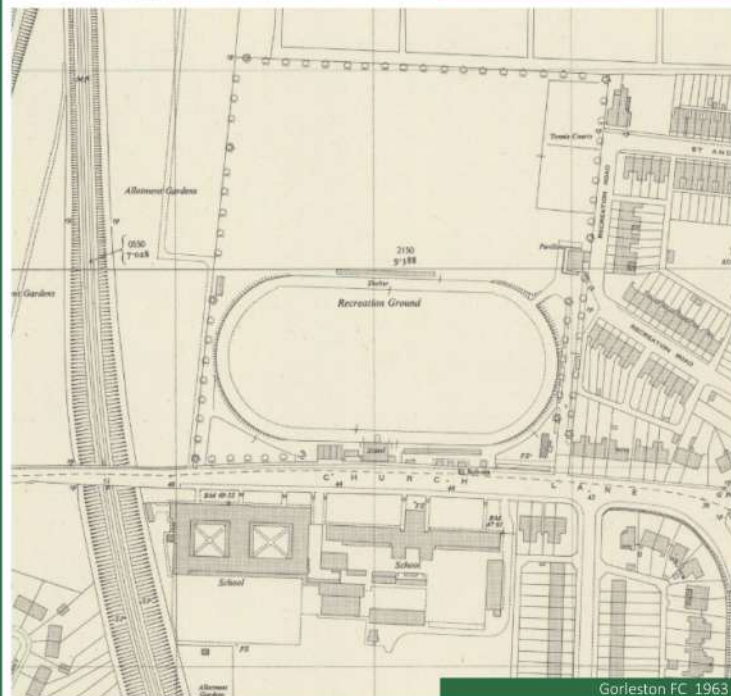
Gorleston FC 1963