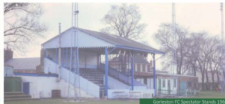
Gorleston FC Spectator Stands 2023